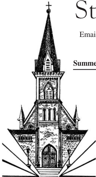
St Louis Catholic Church

Summer hours (Canada Day to Labour Day): Mon. - Thurs. 9 a.m. to 1 p.m.